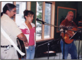
Native Alliance Conference in Lake Nakamun.

that had a big TV and a swimming pool. His most popular choice was the Hampton Inn & Suites.