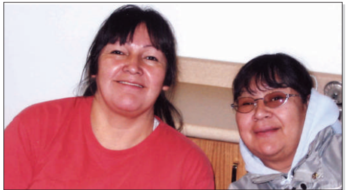
Two ladies from Kashechewan who took the workshop on leadership.

The month of February was busy for me. During the first week I went to Ouje Bougoumou for counseling services. I talked to a lot of people. One of the blessings for me was to help a woman recommit her life to the Lord. She prayed from her heart and said she felt good after praying.