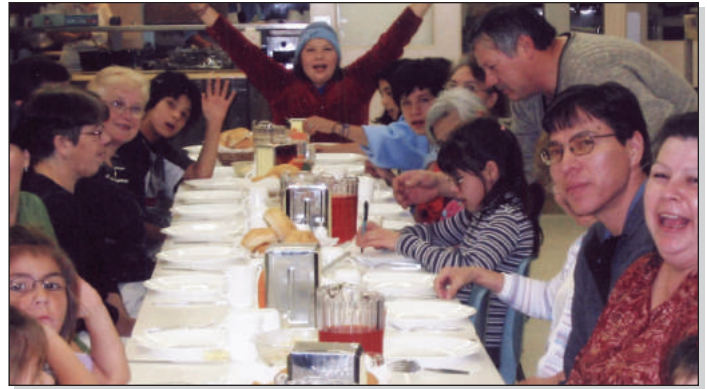
The facilities and meals were excellent at the Galilean Bible Camp.

Right after the gospel meetings in Waskaganish were finished I went to Eastmain for three days. There was a suicide in the community and the Cree Nation of Eastmain invited me to come and do a grief seminar and individual counseling. There was a very good response to all the sessions and the people who organized the meetings were very encouraged by the attendance. While I was there I had plenty of opportunities to share the gospel with the people. The Native people in Eastmain seem very receptive to the gospel at this time.