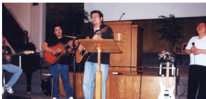
Flaming Fire Ministries.

Attendance for the Conference this year was slightly higher in comparison to last year's Conference. Everyone enjoyed the close Christian fellowship throughout the weekend. Some made close friends with whom they can stay in contact during the year.