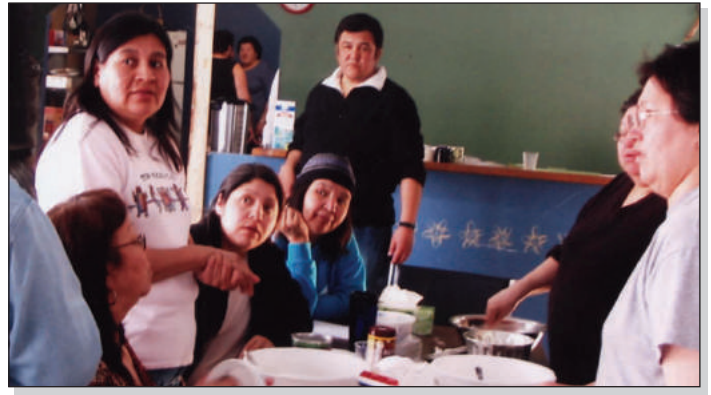
Staff retreat for the Waswanipi NNADAP Program.

grieving process during the Community Wellness Week. As well, I did some individual counseling, and on Sunday I spoke at the community service. I took my hockey equipment and managed to play some shinny hockey there.