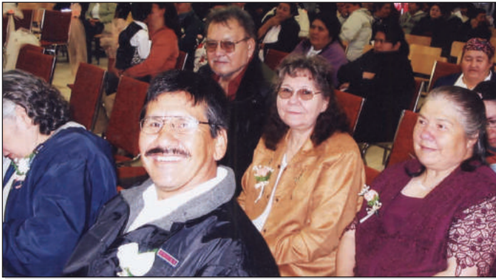
Wedding guests in Waskaganish.