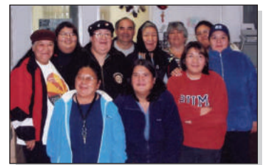
Grief seminar participants in Wemindji.

During the first week of October I counseled a family who were going through a crisis. They came with some of their children to Ottawa to get away from their community for a few days. In March 2004 their parents died two days apart and that was difficult for them to accept. It wasn't hard to talk to them because both parents had been Christians for a number of years. The seven children I counseled are adults now and each had made a profession of faith when they were young. None of them are walking with the Lord but they were open to talk about spiritual things.