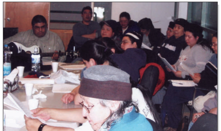
Grief seminar in Eastmain.

I spent the first week of November at a Native Christian Retreat in Blind River, Ontario. This is an outreach ministry coordinated by one of our NGM Board Members so I made a point to attend.