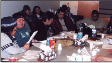
Gospel music was part of the grief workshop in Eastmain.

is a Christian and the Crisis Coordinator there was very encouraged by the response to both workshops.