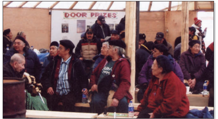
Grief workshop during the Community Wellness Week in Mistissini.

grieving process during the Community Wellness Week. As well, I did some individual counseling, and on Sunday I spoke at the community service. I took my hockey equipment and managed to play some shinny hockey there.