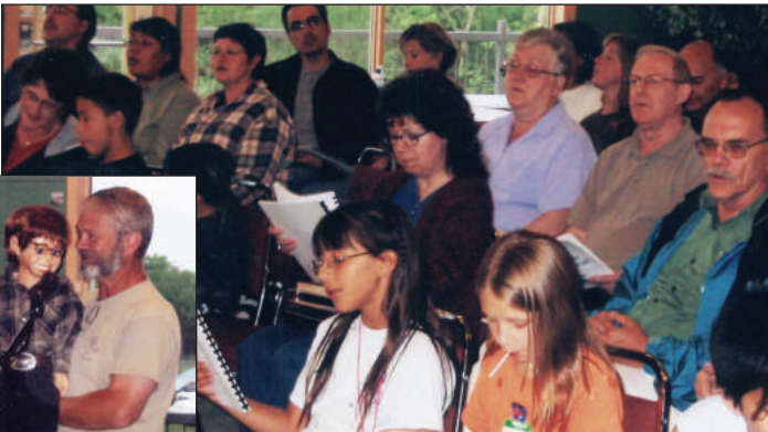
Native Alliance Conference in Lake Nakamun.