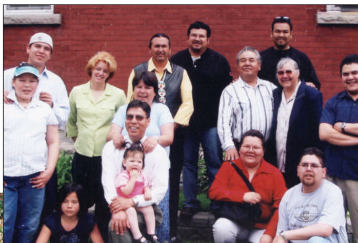
Group picture outside the Calvary Baptist Church.