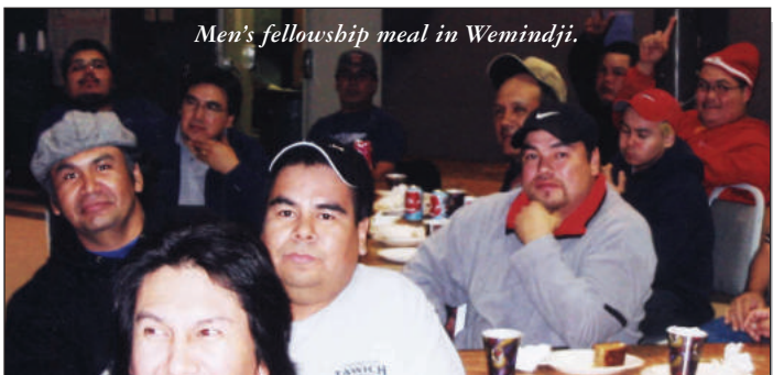
Men's fellowship meal in Wemindji.

After the NGM Conference I went to the Cree communities of Waskaganish and Wemindji. This was my first visit to Wemindji. I led a one day grief workshop there and preached twice at the Anglican church. The Sunday