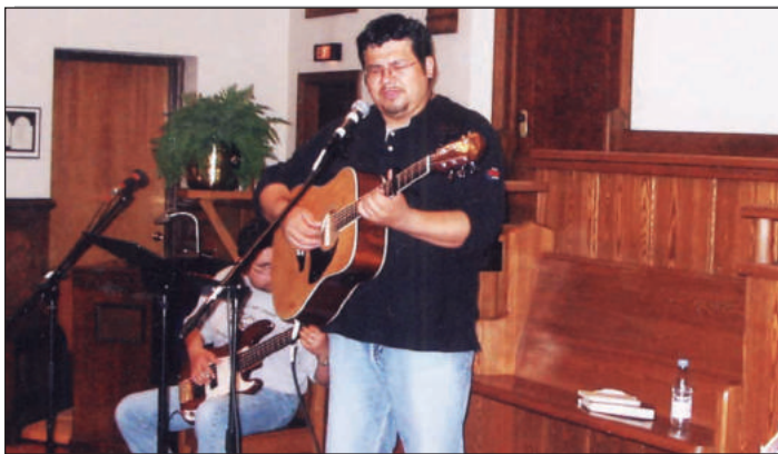
Flaming Fire Ministries

Our 9th Annual NGM Conference in Ottawa was held on June 4 - 6, 2004, at the Metropolitan Bible Church. We were encouraged by having more people in attendance this year. One of our NGM Board members made a comment that this was one of our better conferences for awhile.