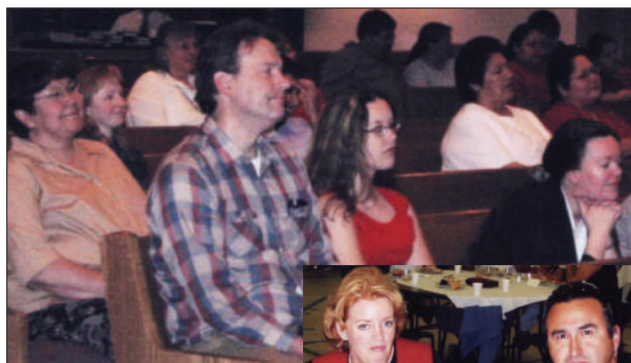
Church service at The Metropolitan Bible Church

The conference, as always, was free of charge. We rely upon goodwill offerings for the special guests' accommodations, meals, traveling expenses, honorariums and other related expenses. Although there were not a great many people at the Conference, the total offerings came to $2113.03. We received other donations through our office during the year and we thank the Lord that we were able to cover all of our Conference expenses.