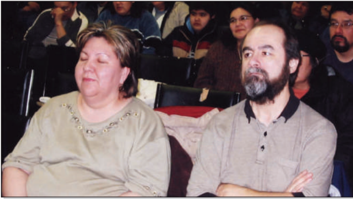
Gospel meetings at the Waskaganish Cree Gospel Fellowship.

non-Native churches in Ottawa where I have spoken a few times over the years.