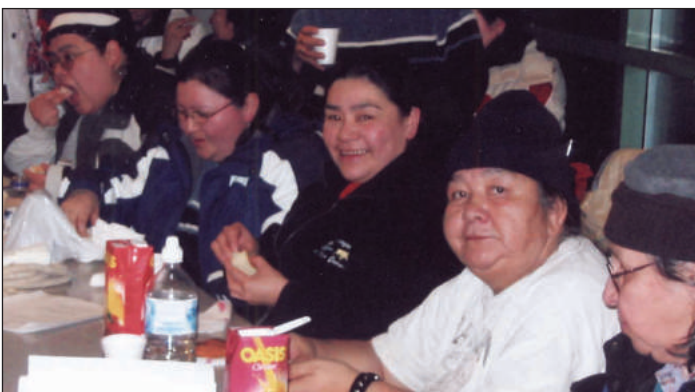
There was a good response for the grief workshop in Eastmain.

My next trip took me to Mistissini. I was invited to be one of the facilitators for the Conference on the Residential School Days. I was assigned to speak on the topic of "Forgiveness." I was also asked to do a presentation on the