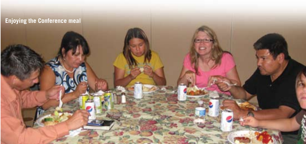
Enjoying the Conference meal

To host a Conference is always a major expense and we rely upon the freewill offerings during the Conference. We also try to raise extra financial gifts and donations through our NGM News Tracker. I also talk to individual people who may be able to send a financial gift for the Conference. God has been good to NGM each year to be able to cover all the Conference expenses. PTL!