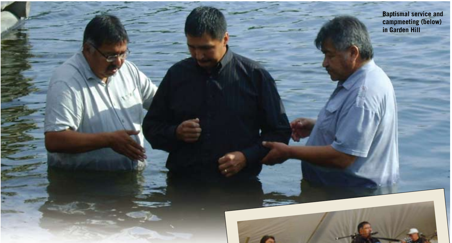
Baptismal service and campmeeting (below) in Garden Hill

I went to Waskaganish to do crisis counseling on July 30–August 3, 2010. While I was there I preached twice at the Waskaganish Pentecostal Church.