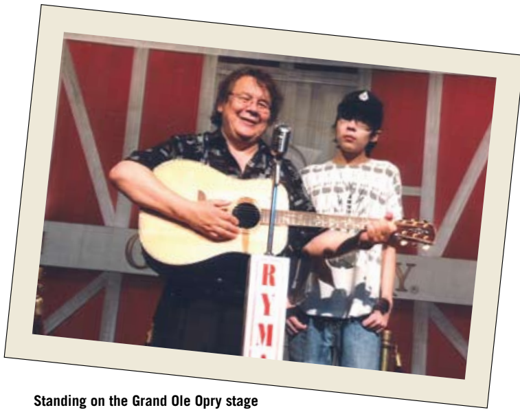
Standing on the Grand Ole Opry stage

On April 18–21 the community of Waswanipi invited me hold workshops on grief and do some crisis counseling. I don't often go to Waswanipi but they have gone through a number of crisis situations this past year and I felt it was important to respond to their invitation to do workshops and individual counseling. While I was there I shared on the radio a couple of times to talk about the grief process and suicide.