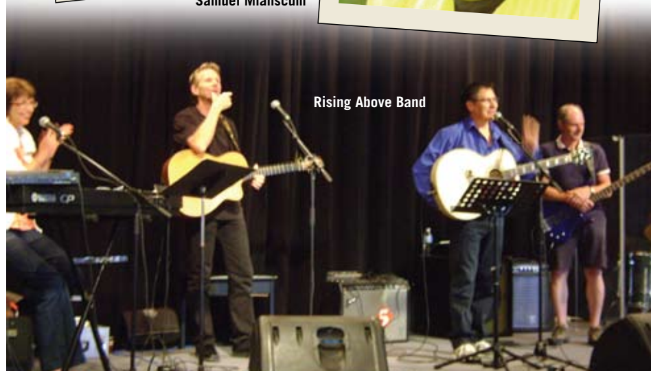
Rising Above Band