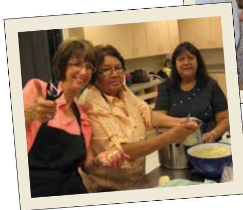
Preparing the banquet meal

so I preached Sunday evening at the Metropolitan Bible Church. They gave us