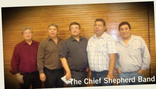
The Chief Shepherd Band