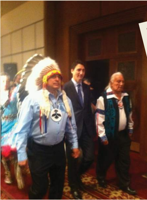
Parade march for Prime Minister Justin Trudeau