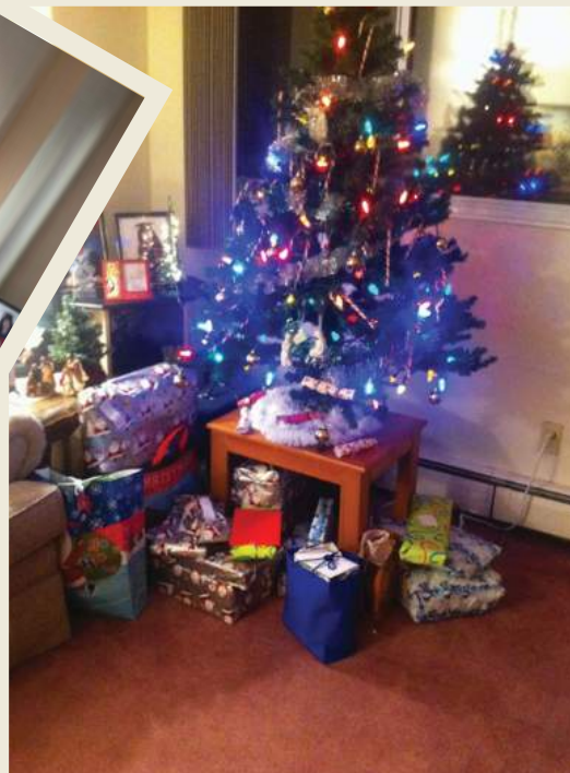
Christmas tree in our home