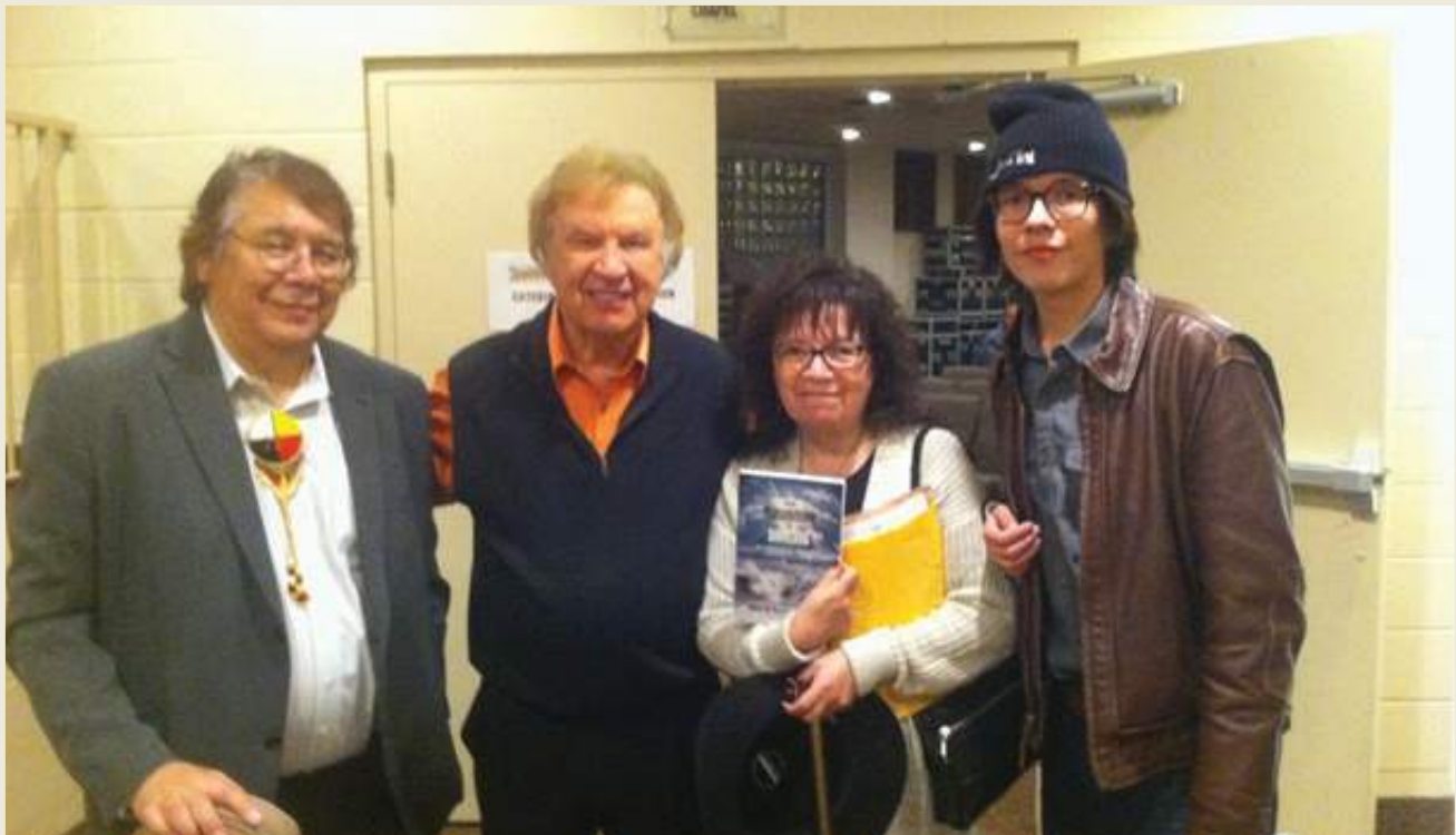
Our meeting with Bill Gaither backstage