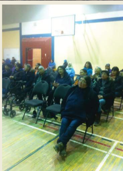
Gospel Jamboree in Kashechewan

On March 21 – 25 I went to Kashechewan, ON to do a grief seminar and individual counseling. I was busy the whole time I was there. During the day I did the workshops and in the evening I preached at the fellowship meetings at the Anglican Church. They tore their old church building down and are temporarily meeting in another building. They had a gospel jamboree and they asked me to speak that night as well. I have gone to Kashechewan several times in the past and I know a few people there. Besides the Anglican Church there is a Pentecostal church so there are a number of Christians in the community. The people were getting ready to evacuate because their community usually gets flood when the ice breaks up on the river.