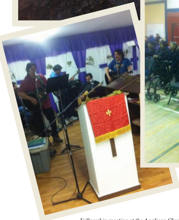
Fellowship meeting at the Anglican Church