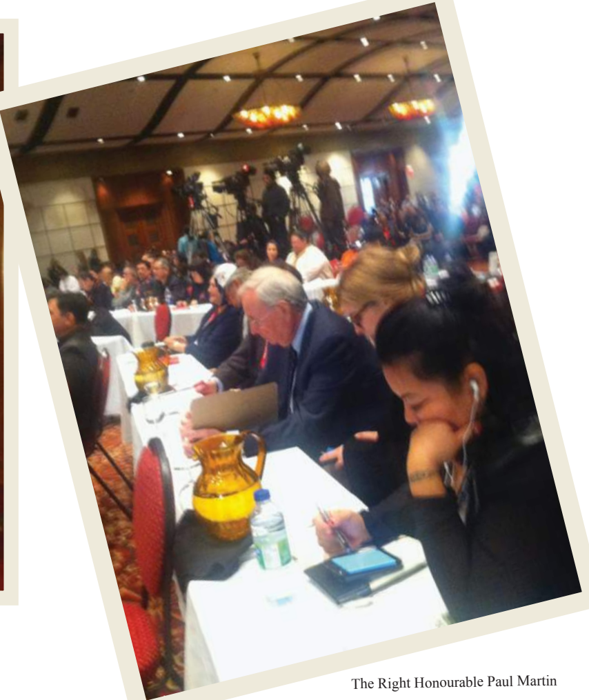
The Right Honourable Paul Martin