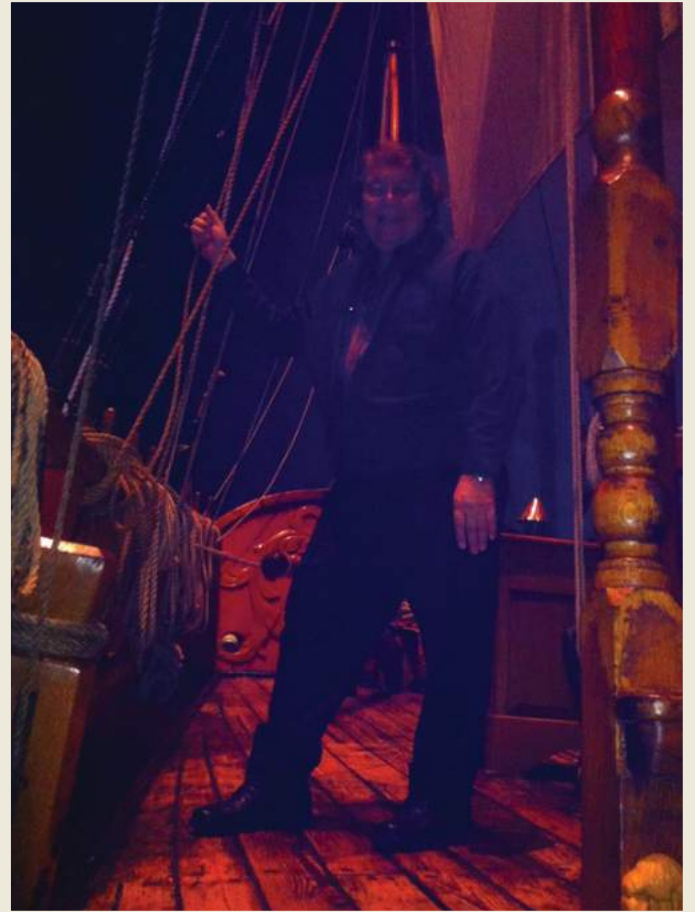
On board the Nonsuch replica